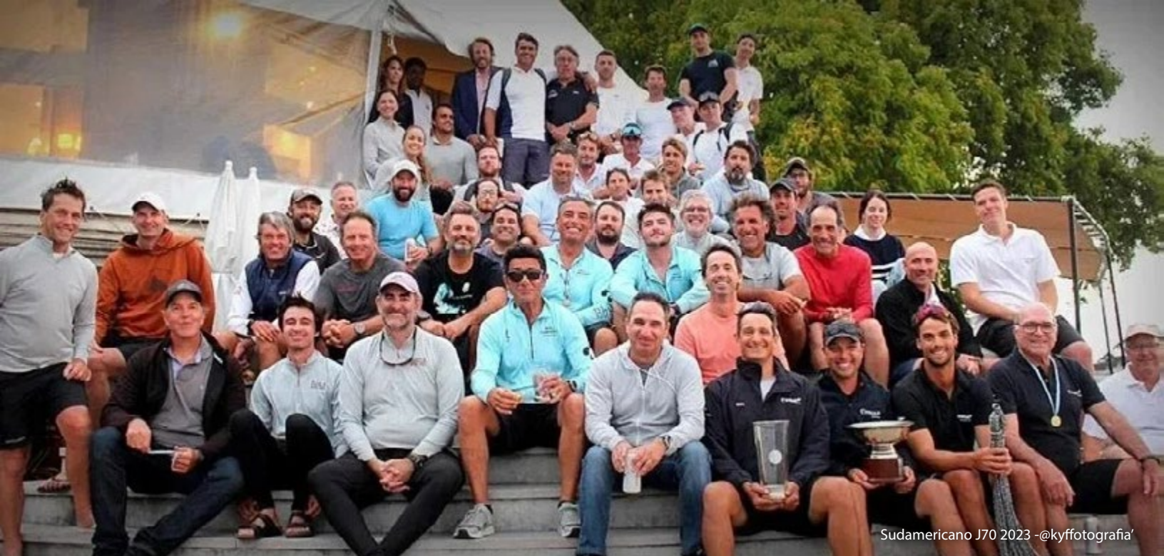
Sudamericano J70 2023