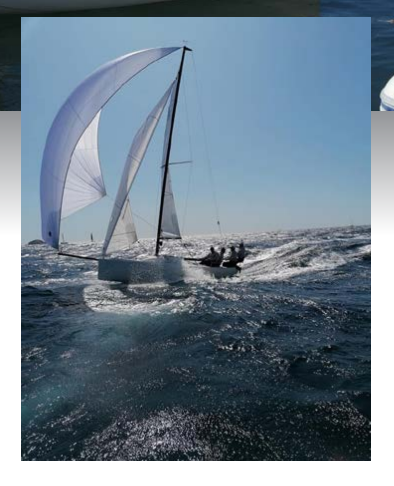
This French National will be also the Final for the J/70 Med Cup and open to foreign competitors.

Our main event will be the National in Marseille (the 2024 Olympic Games place), where we are planning to welcome more than 40 boats.