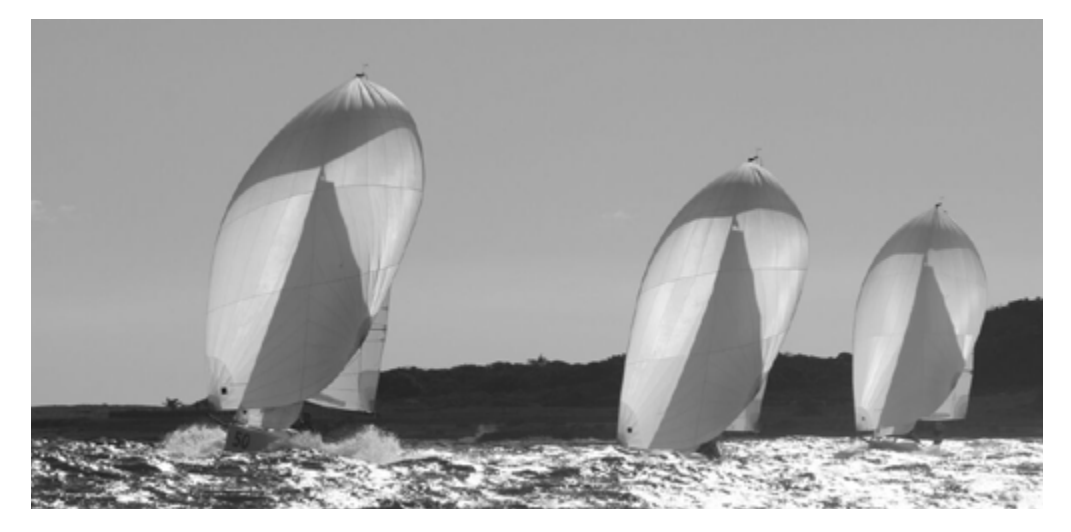
J/70 Momentum • Volume 8 • Issue 1 • WINTER 2020 • Page 4

Locals were astonished to wake up for another day of SW wind on Friday. Being too heavy in the morning, a precise delay allowed for the conditions to improve. Sun, transparent green water, ocean swells and 12-14 knot warm wind made for excellent sailing conditions again, in which Claudia and Alberto dominated the fleet, in preparation for an intense last day of racing. More SW wind awaited the competitors on the last day. Two points separated all four top places: Claudia Rossi 33, Parada 35, Alberto