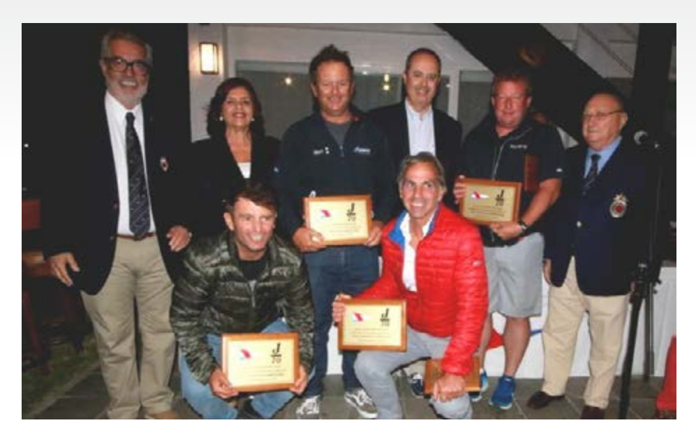
J/70 Momentum • Volume 8 • Issue 1 • WINTER 2020 • Page 6

Pictures can be viewed at <u>https://www.</u> <u>dropbox.com/sh/elp85626etn4lid/</u> <u>AADQf4H2KrYn73X3cVuQOiXWa?dl=0</u>.