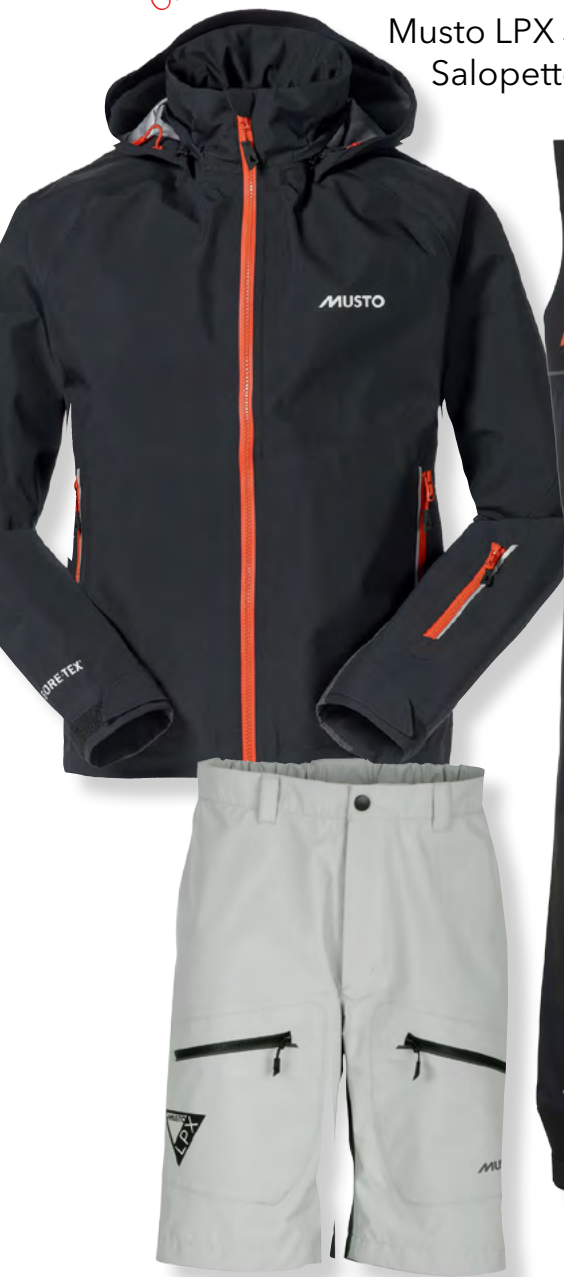
Musto LPX Jackets, Salopettes and Shorts