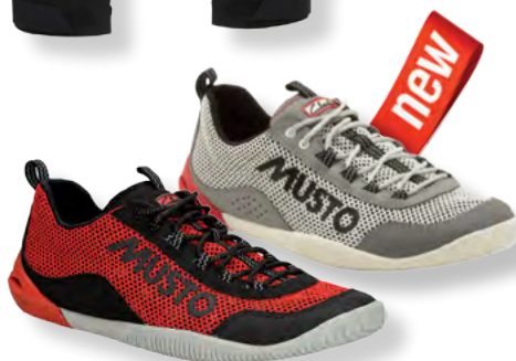
Musto Clarks Dynamic Pro Shoe