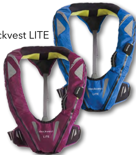
Spinlock Deckvest LITE