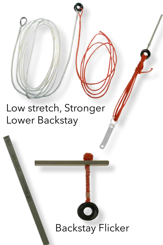
Low stretch, Stronger Lower Backstay